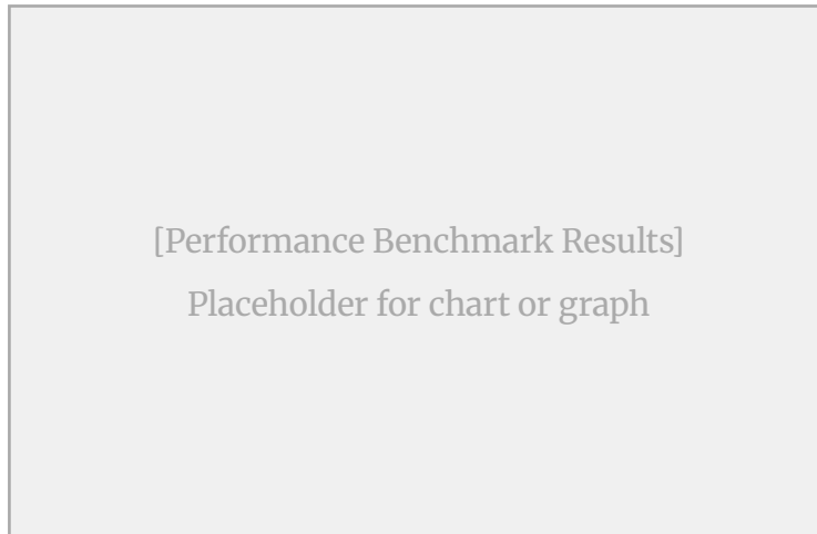
Figure 2: Response time measurements under varying load conditions

As shown in Figure 1, the system follows a three-tier architecture pattern. Performance characteristics (Figure 2) indicate linear scaling up to 10,000 concurrent users.